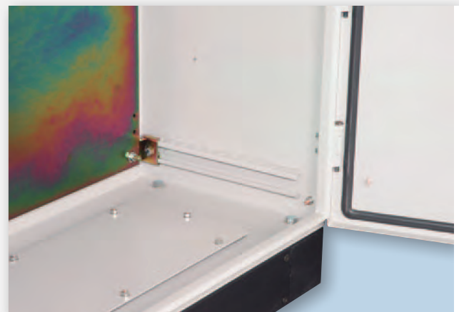
* Bottom internal view

Manufacturer:- CVS METAL INDUSTRIES SDN. BHD. (173532A) No. 1, Jalan BK 1/14, Bandar Kinrara, 47180, Puchong, Selangor, Malaysia. Tel: 603-8070 5279/1960 Fax: 603-8070 3920 Website: www.cvs.com.my ; www.cvsenclosure.com E-mail: office@cvs.com.my