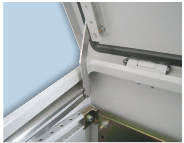
* Top internal view